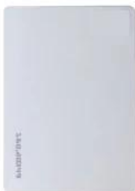
Master Add Card