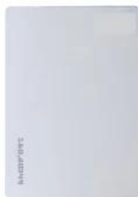
Master Delete Card