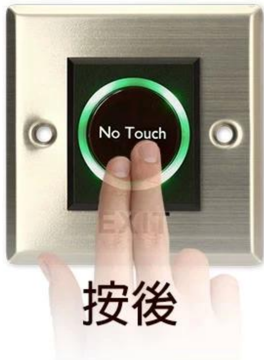
Green LED Indicator: Power ON (Triggered)